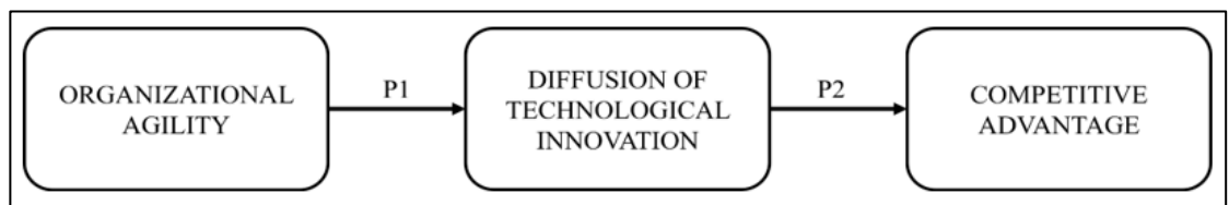
Figure 1: Theoretical Proposition Model

Figure 1 presents a model of propositions based on the theoretical lenses of Organizational Agility (OA), Diffusion of Technological Innovation (DTI) and Competitive Advantage (CV) that are explained in detail in sections 3.1 and 3.2 of this work, analyzing the phenomenon investigated by articulating the reference bases.